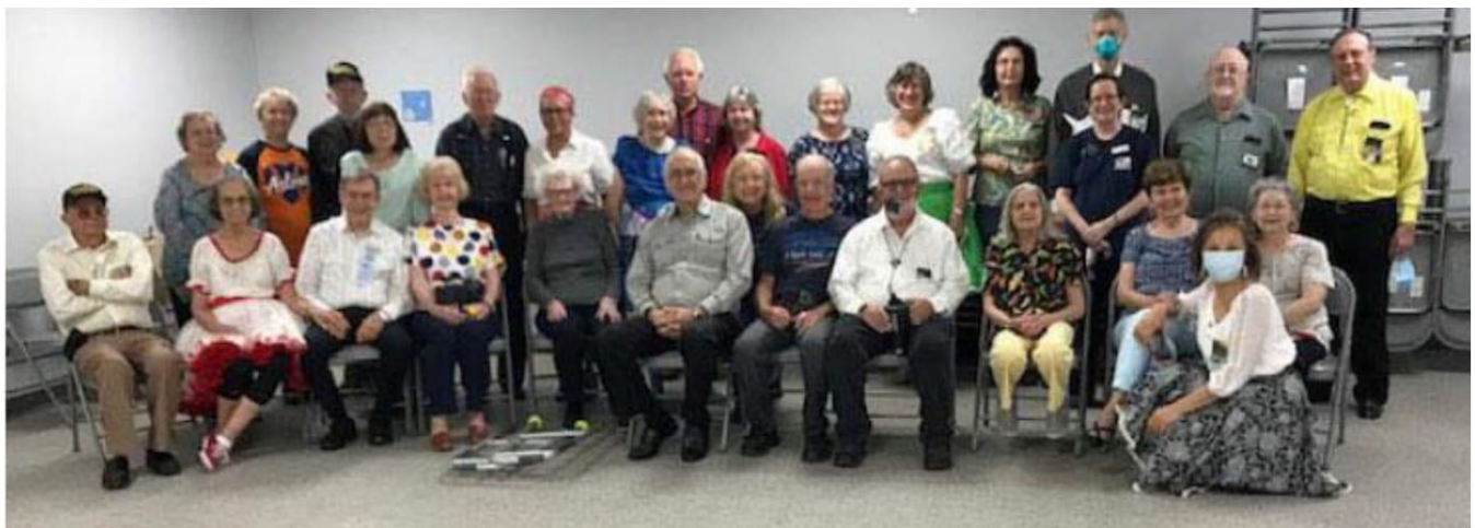
Fairbees Dance Club Members and Friends

Call or text us if you have any questions. 😊😊